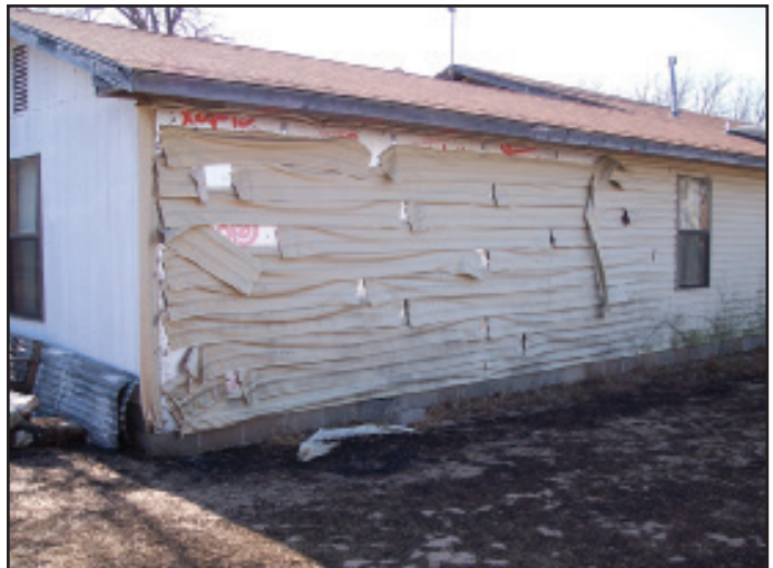
When this vinyl siding melted, it exposed other combustible materials.