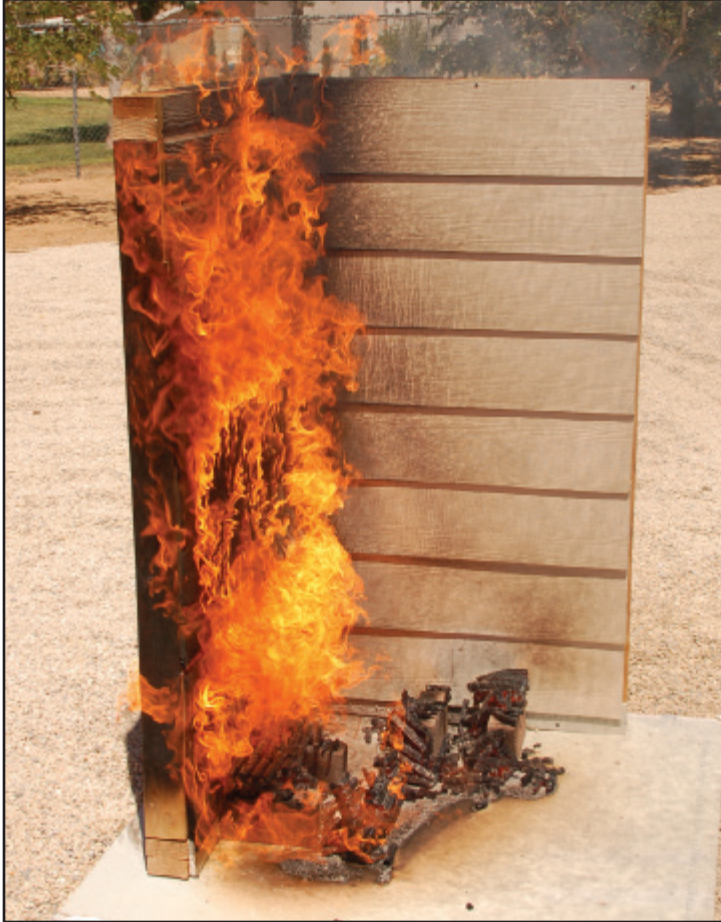
This photo shows the difference between combustible siding (left) and fiber cement siding (right) when exposed to the same direct flame source.

The exterior walls of a home will need to be resistant to radiant heat and direct flame contact. For homes with vinyl siding, the radiant heat from a wildfire may become intense enough to melt the siding. This could possibly expose crevices in a home and allow embers to enter.