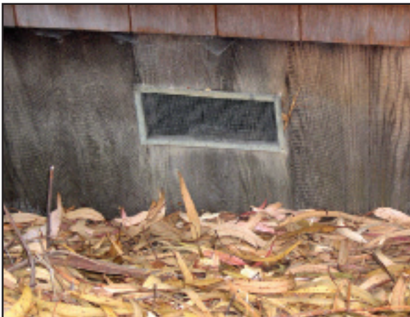
Combustible material like this mulch, near skirting or siding, leaves the home unprotected, even with screening in place.

There are several different types of vents for a home. These vents play a vital role by supplying openings for air to flow through. However, these vents can allow embers to enter a home during a wildfire.