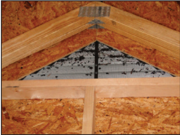
Screening helped capture these embers and prevent their entry into the attic.