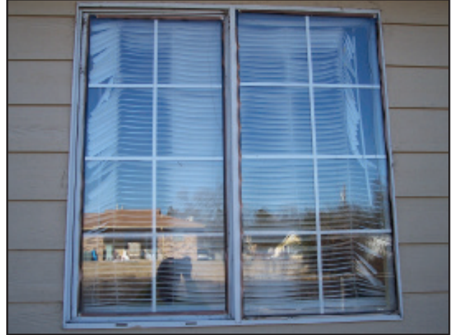
Radiant heat melted the interior blinds.

Window screens also play a vital role during a wildfire. They will absorb and redirect radiant heat, allowing the glass to absorb less. If the glass breaks, screens may also prevent embers from entering.