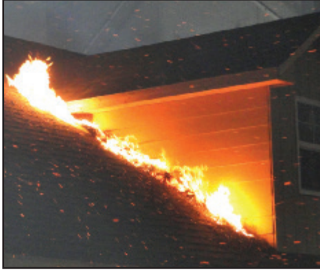
Leaves and needles burning along roof edge with dormer.