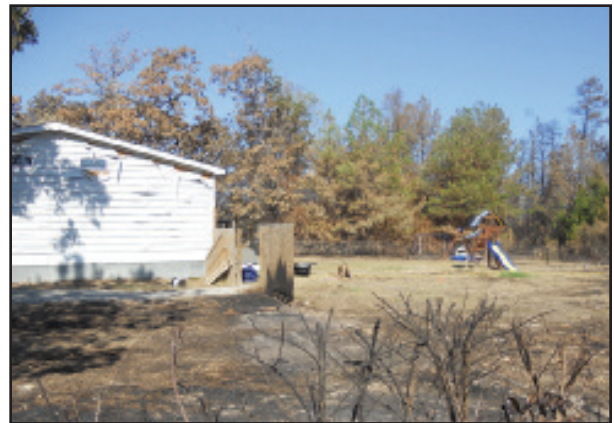
This home escaped the flames when firefighters knocked down the burning fence that would have led flames to the home. Notice the burn marks on the fence.