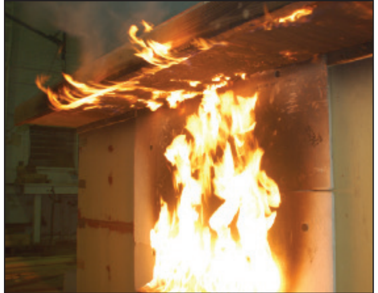
Direct flame on siding burns into the eaves and roof.

Angle flashing also should be used, as discussed in the roof section of this guide.