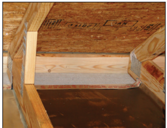
With roof edge flashing, fewer embers enter the attic area.