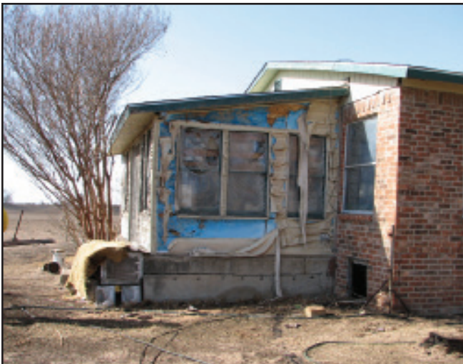
The vinyl siding and window frame on this home melted when exposed to radiant heat.

Use non-combustible siding and make sure there are no crevices or holes that could potentially catch embers.