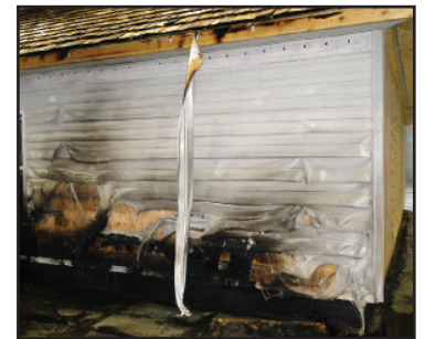
This vinyl gutter melted from heat, exposing the wood and roof edge to embers and direct flame.

Install gutter guards to keep debris from accumulating. Maintain the roof where the gutter connects to make sure debris does not accumulate between the guard and roof.