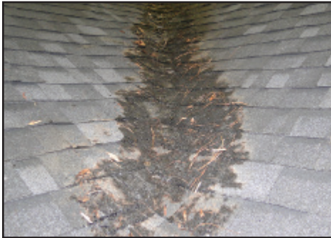
The pine needles on this roof burned, but the Class A roof did not.

The roof is one of the most vulnerable areas of a home. It is a large surface that is capable of catching embers during a wildfire. A roof also can collect dead vegetation such as pine needles and leaf litter, which will readily ignite. So the maintenance of a roof is as important as the materials used to construct it.