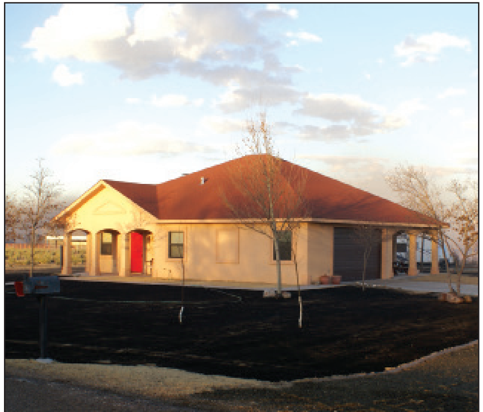
Firewise construction and landscaping helped protect this home from wildfire.

“Hardening a home” is a term used to describe the retrofitting process that reduces a home's risk to wildfire. This involves using non-combustible building materials and keeping the area around your home free of debris. The following pages will describe each section and offer alternative building materials that will reduce a home's risk to wildfire.