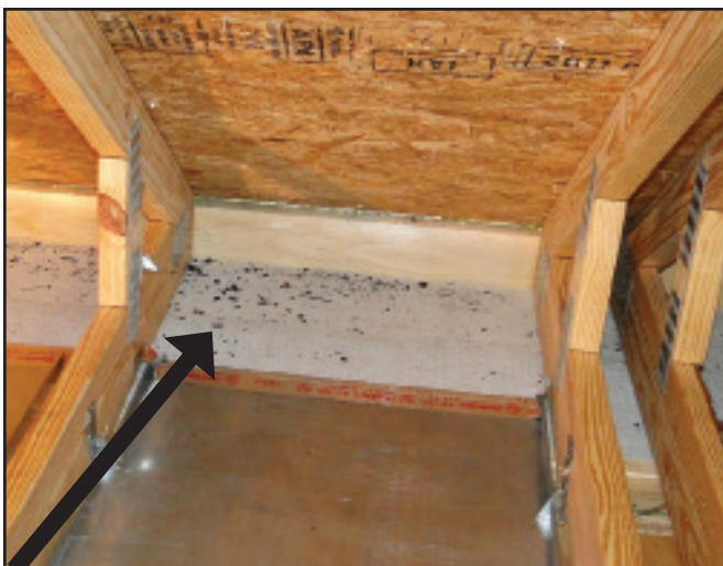
Without roof edge flashing, embers can enter into the attic.

Box in eaves with non-combustible material.