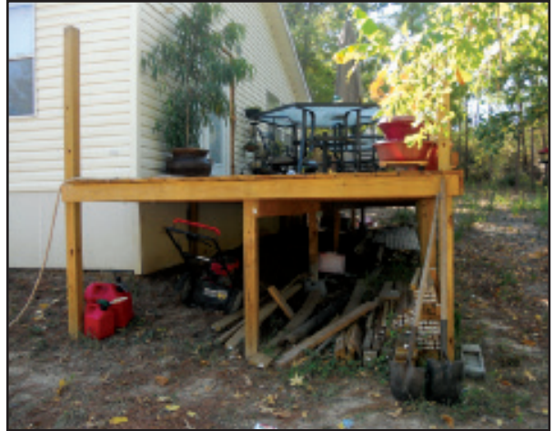
Materials under this deck could easily catch the home on fire.