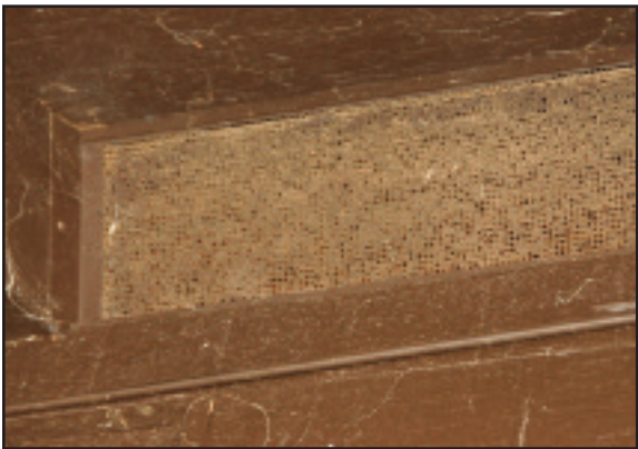
This screen prevented embers from entering.