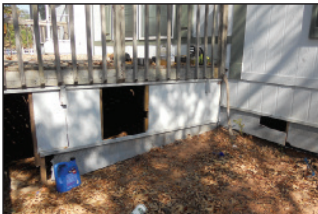
The flammable skirting under this deck, along with mulch, could easily lead flames to the deck and home.