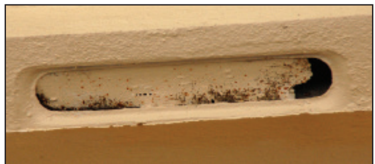
Vents can clog. This vent was painted over, reducing its effectiveness in providing ventilation.